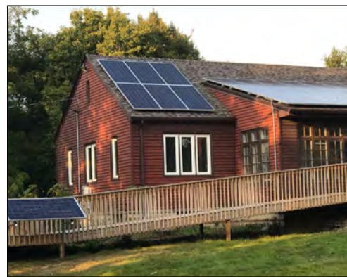
Solar at the Minnesota Valley Chapter house.