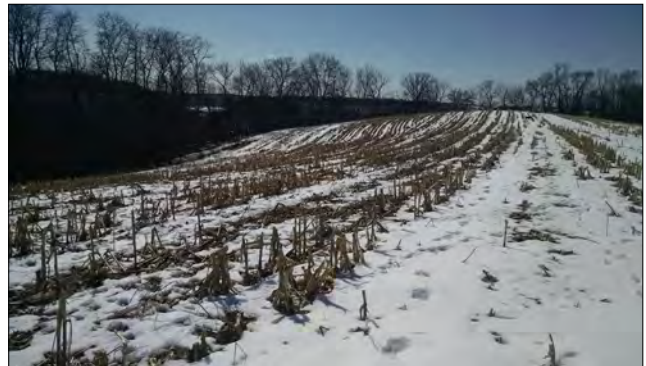
Winter scene in the Driftless area.