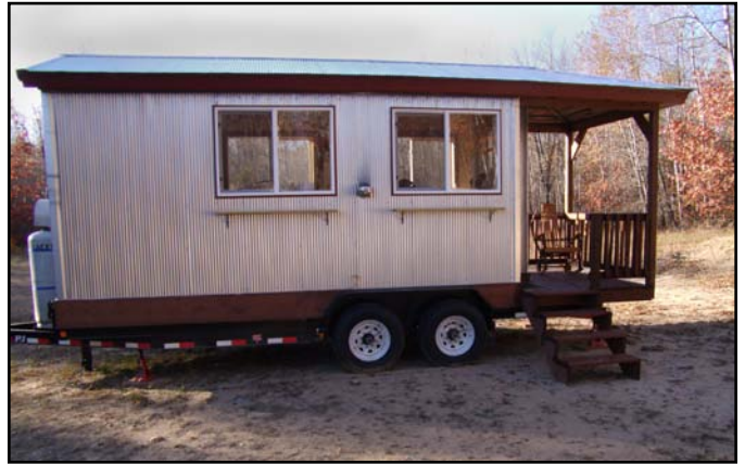
The Kristi Harrington Loftis Memorial Tiny House at Deep Portage Learning Center at Hackensack, MN.